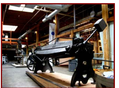
By the 1920s, "Tank House 7" had been transformed into Gooderham & Worts' Denaturing Room to create industrial alcohol, such as anti-freeze. Pure alcohol was pumped through overhead pipes into the Mixing Penthouse. Here it was weighed and chemicals were added to render the alcohol undrinkable, untaxable, but very profitable.