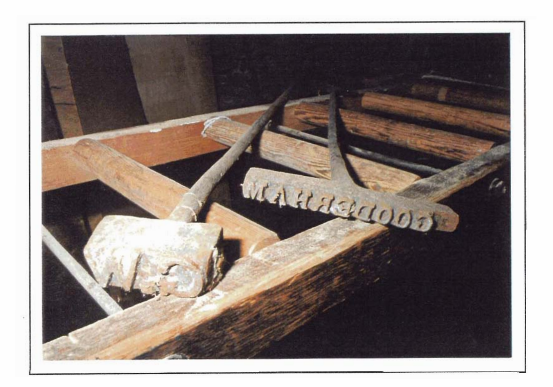
45-1-2/3 Barrel Brands