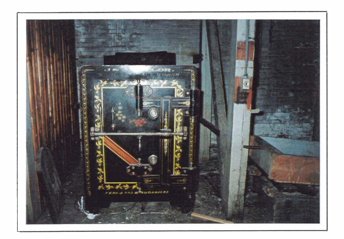
46-1-2 Office Safe