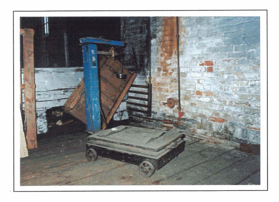
46-1-1 Platform Scale