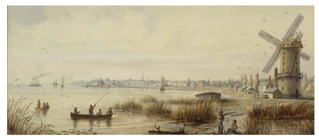
Windmill, ca. 1832