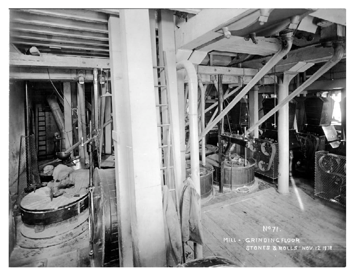
1918 Mill floor with millstones & high rollers